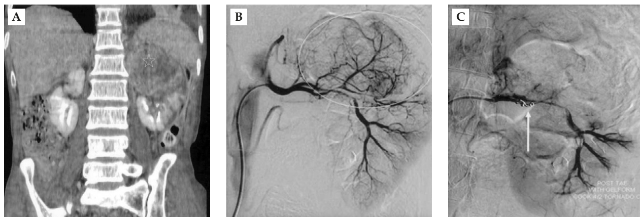
Figure 1. (A) Computed tomography: coronal reconstructive section shows a 12 × 13 cm mass in the upper pole of the left kidney (star). (B) Angiography shows a hypervascular mass located in the left upper kidney (circle). (C) Selective embolization of the tumor by the metallic coil is successful (arrow).