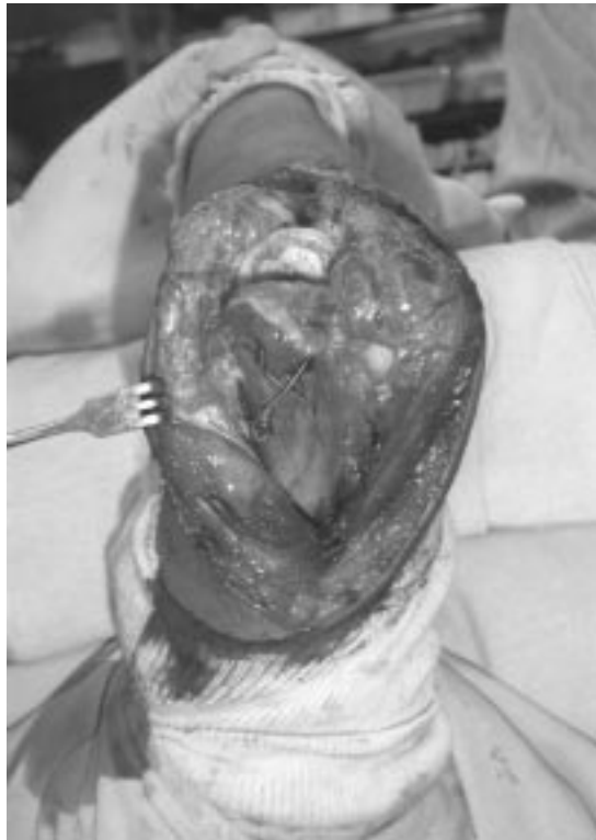
Figure 2. Intraoperative photograph showing close-wedge osteotomy of the lateral condyle of the right humerus using a posterior triceps sparing approach.