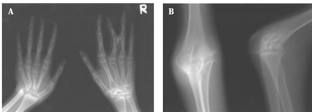
Figure 1. (A) Radiograph of both hands shows vanishing carpal bones and tapering left second to fifth metacarpal bones. (B) Radiograph of the right elbow showing the absence of the medial condyle and relative enlargement of the lateral condyle.

The natural course of Gorham osteolysis is generally unpredictable. Most cases are benign with spontaneous arrest in the few years after osteolysis [3,5]. This disease is usually reported in the second or third decade of life, and is not predicated on gender or race [6]. The initial clinical complaint is substantial pain or soft-tissue swelling, which frequently follows trauma. Then, local progressive and spontaneous resorption of bone in multiple focal or unifocal areas results in functional disability and deformity or even