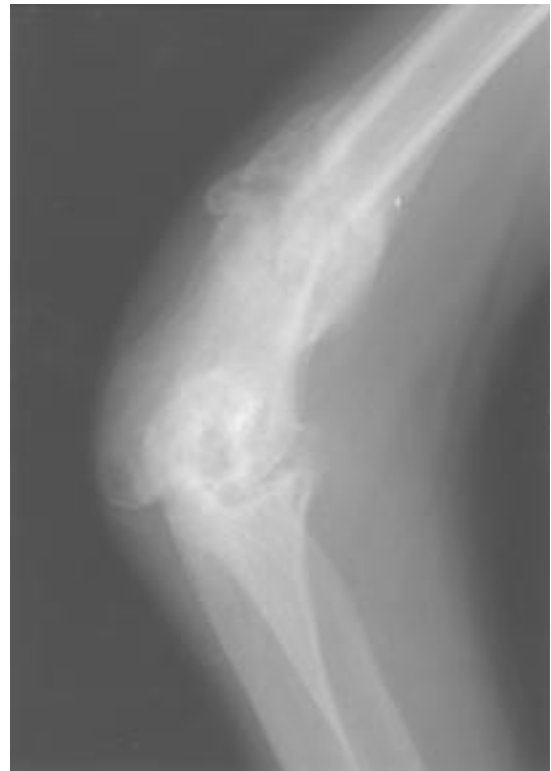
Figure 4. After 10 months' follow-up, radiograph of the right elbow shows healing of the fracture site and no further bone absorption.

pathologic fracture [5]. The potentially fatal complications include spine involvement and pleural effusion. Progressive osteolysis of the spine may lead to paraplegia, and recurrent pleural effusion may cause infection as well as cardiovascu-