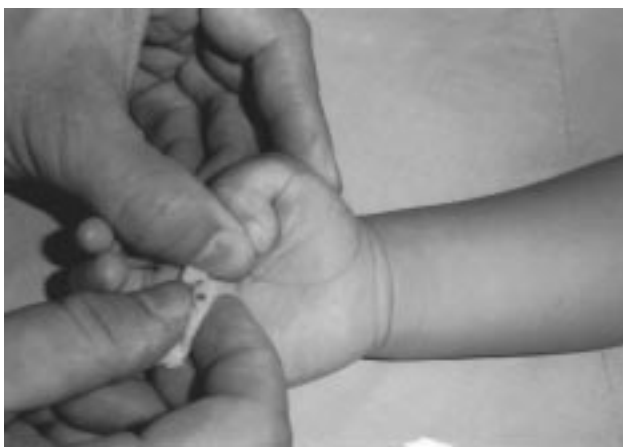
Figure 2. Special manipulation under general anesthesia to assess complete release of the A1 pulley. The thumb is flexed as the nodule of the flexor tendon crossing over the A1 pulley is pushed back, then the thumb is extended. If the A1 pulley is not completely released, snapping will appear again during this maneuver.

In our patients, the symptoms of affected thumbs were primarily fixed flexion contracture, Notta’s node, and pain. Other presentations, including active extension loss, trigger or snap, were sometimes hard to approach due to the young age of these children. Three children had clear trauma events: