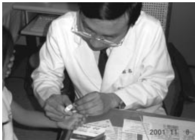
Figure 1. Percutaneous release under local anesthesia for trigger thumb in children as an office procedure.

We performed percutaneous release on the trigger thumbs of children using two different anesthetic procedures, general or local anesthesia. Local anesthesia was achieved using 1 mL of 2% xylocaine to block digit nerves. In our office, the patient underwent the release procedure 5 minutes after digital block (Figure 1). In the group receiving general anesthesia, we used two methods: intravenous agents such as thiamylal sodium (Citosol ® ; Kyorin Pharmaceutical Co Ltd, Tokyo, Japan), fentanyl citrate (Dura-gesic ® ; Janssen Pharmaceutica, Titusville, NJ, USA) and