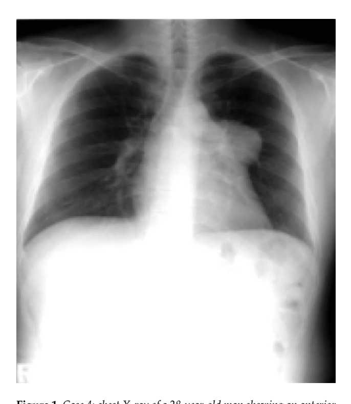
Figure 2. Case 4: chest computed tomography revealing an anterior mediastinal mass with a fat-containing soft-tissue mass.

The most common symptoms were dry cough (5 cases), chest pain (3 cases), fever (3 cases), and shortness of breath (3 cases) (Table 1). One patient with teratoma had massive left pleural effusion. Four patients were asymptomatic, with tumors encountered accidentally during health examinations. All asymptomatic patients had teratomas.