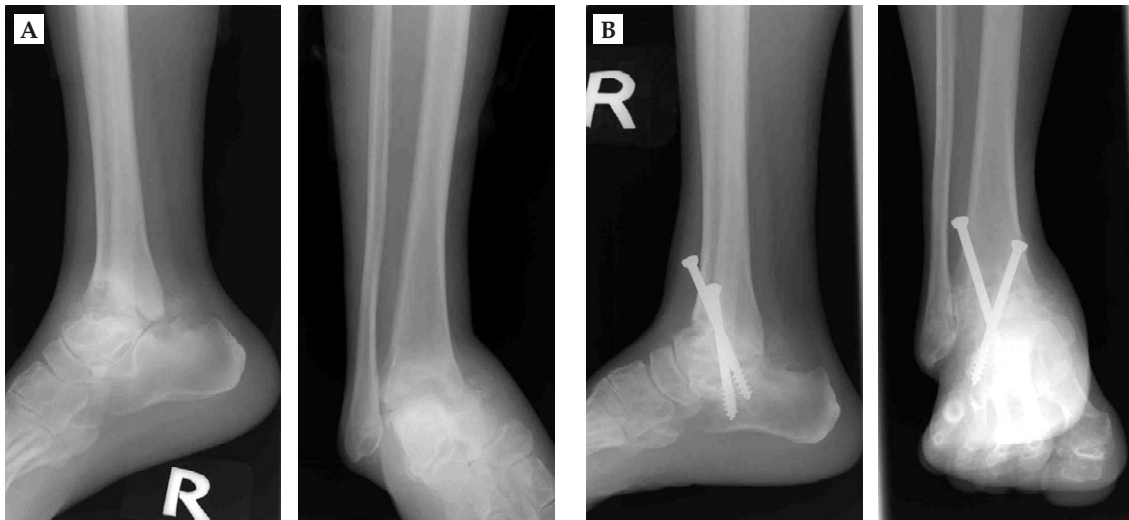
Figure 1. (A) This 60-year-old woman had diabetes mellitus with ankle joint varus deformity. (B) She received tibiotalar calcaneal fusion, and solid union was achieved.