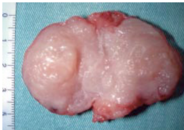
Figure 3. The specimen is 5.0 x 4.5 x 2.2 cm in size. Grossly, the mass is white-gray in color and the surface is nodulated.

Leiomyoma may develop in any layer and can be endovesical, intramural, or extravescical in location. The endovesical form has been reported in 63%, extravescical in 30%, and intramural in 7% of cases [6].