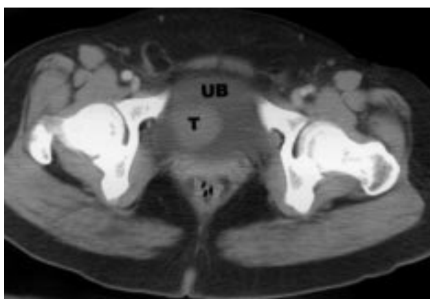
Figure 1. Axial contrast computerized tomography reveals a round homogeneous solitary tumor (T) protruding into the urinary bladder (UB) from the right lateral wall.

Convalescence was uneventful and the patient was discharged 1 week later. The patient remained well during 1 month of follow-up and no further urinary frequency and nocturia were noted.